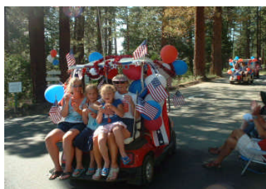
Summer fun in Glenbrook!

Our community, located on the shores of one of America's greatest treasures and in the shadow of Shakespeare, is a special place, not only for its geographic location and amenities but also because of its people. Words cannot adequately express the appreciation and thanks due to Glenbrook's volunteers, management, consultants, and employees who make this special place so extraordinary.