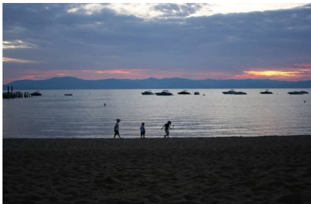
Children on Glenbrook's Beach